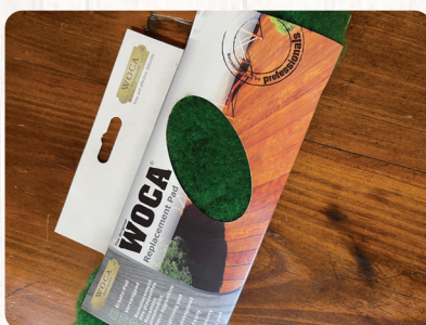
Replacement Applicator Head