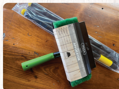
Applicator & Handle