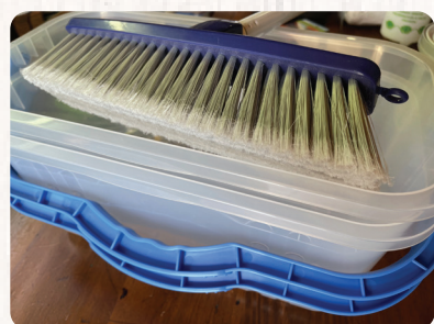
Bucket & Broom

The only recommended oil to be used on Bamboo is WOCA oil - this can be found in many tinted colours and offer a very natural oil and does not leave a skin on the surface.