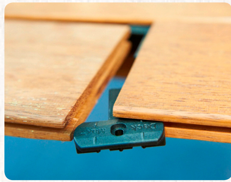
End Match - pre grooved both ends of the decking board & Undercut. Reduces waste by 70%