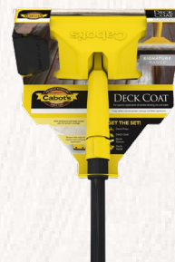
Applicator & Handle