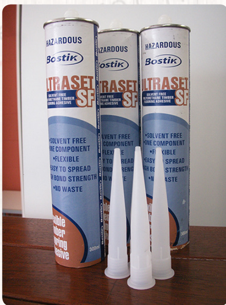
Bostik Ultra Set - 300ml cartridge - coverage approx. 5 square metres. This is used as an acoustic membrane to remove the rattle and squeak between the deck board and the joists.