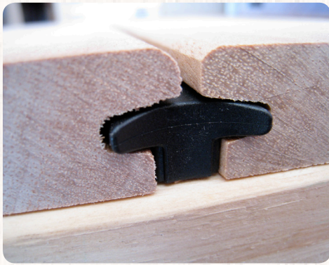
Pro Decking - Pre Grooved both sides - No more nails or screws in the surface of your deck. You can choose 3mm or 5mm gap.