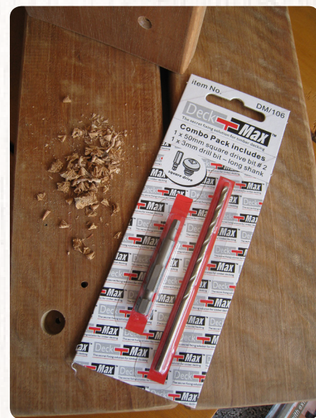
Combo Pack - 1 x 100mm long drill bit x 3mm + 1 x 50mm # 2 square drive bit. One stop shop to be sure you are supplied the with all the correct tools.