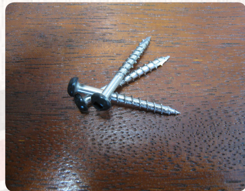
Screws - Self Drilling timber screws & OR Self drilling for metal frames. Hi Tech design allows for maximum performance. The pan head design delivers the strongest possible torsional strength.