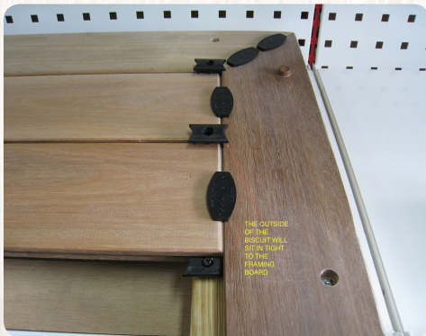
Butt Joiners - for mitred corners, picture frame joints, Butt Joints - as used by cabinet makers this makes it stronger